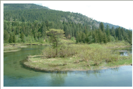
Being a Steward of our Environment helps to ensure the continuance of the quality and health of our watershed!

Best Management Practices (BMP's) and Guidelines are approaches based on known science that, if followed, should allow the client to meet the required standard(s) or achieve the desired objective(s).