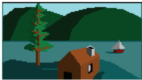
Christina Lake Stewardship Society - (250) 447-2504

THE REAL ESTATE FOUNDATION OF BRITISH COLUMBIA