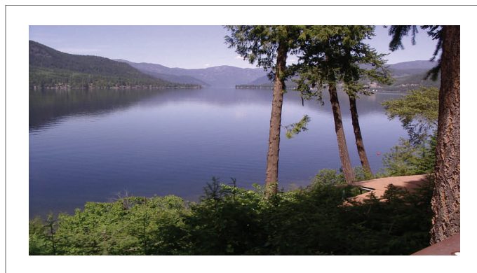
Christina Lake — Yours to Preserve and Protect

Economic development will and must occur to make us